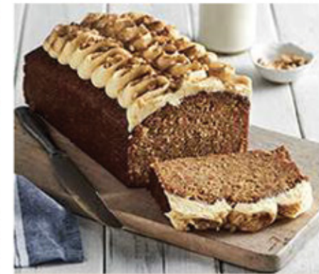
CARROT CAKE LOAF