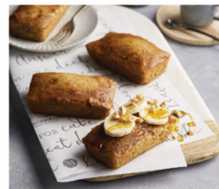
BANANA BREAD MINI LOAF