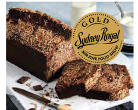
BELGIAN CHOCOLATE & COCONUT BANANA BREAD