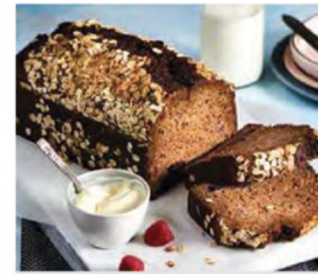
PEAR & RASPBERRY BANANA BREAD