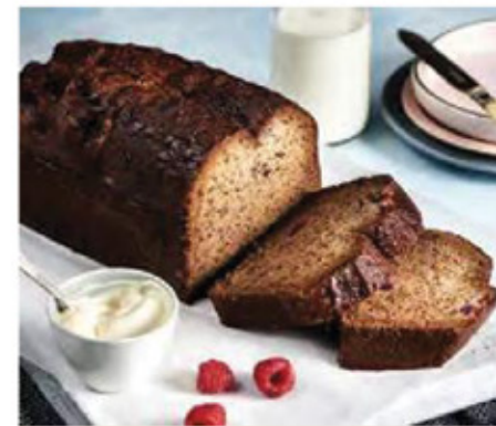
PEAR & RASPBERRY BANANA BREAD